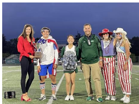
Omaha Skutt Catholic Class B All-School Division Boys Division

The 2021-2022 NSAA Cup presentations concluded in September. For more information about the NSAA Cup and the 2021-2022 Cup standings, click here .