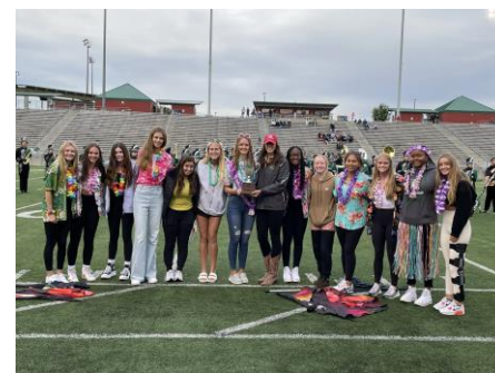
Lincoln Southwest Class A Girls Division