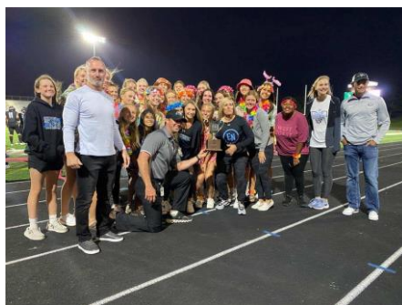
Elkhorn North Class B Girls Division