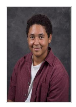
Franklin Fields Falls City